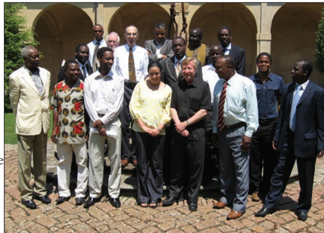
Members of the Darfur consultation gather in a courtyard in Siena.

The Institute for Conflict Analysis and Resolution (ICAR) is actively engaged in peacebuilding efforts in response to the conflict in Darfur, a conflict that has left over 300,000 dead and two million people displaced from their homes since 2003. Such peacebuilding efforts constitute a core mission of the Institute, and were given a boost in July 2009 when 17 representatives from six armed movements involved in the conflict met in a neutral setting for a consultation aimed at promoting peace in this ravaged region. The movements represented were: the United Resistance Front, the United Revolutionary